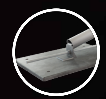
fireproof base plate