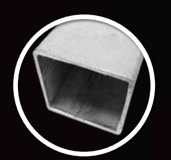
heavy duty square post