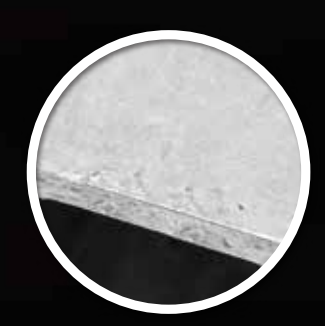
fully hot-dip galvanised