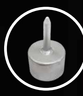
heavy duty brace cap