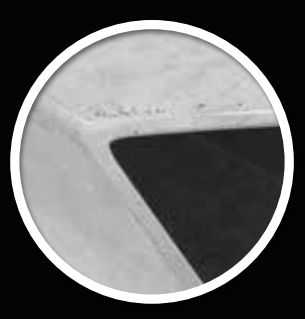
clever edges to avoid compaction