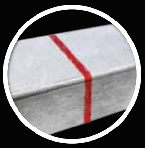
innovative ground mark